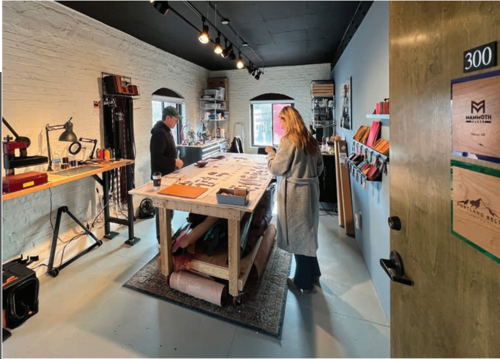
SUITE 300 - 288 +/- SQ FT