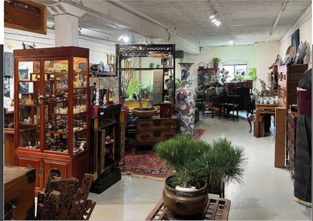
SUITE 350 - 2,030 +/- SQ FT